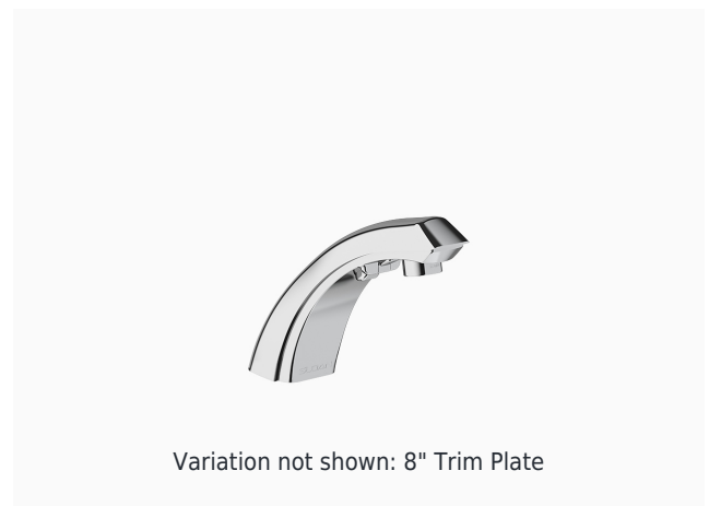
Variation not shown: 8" Trim Plate